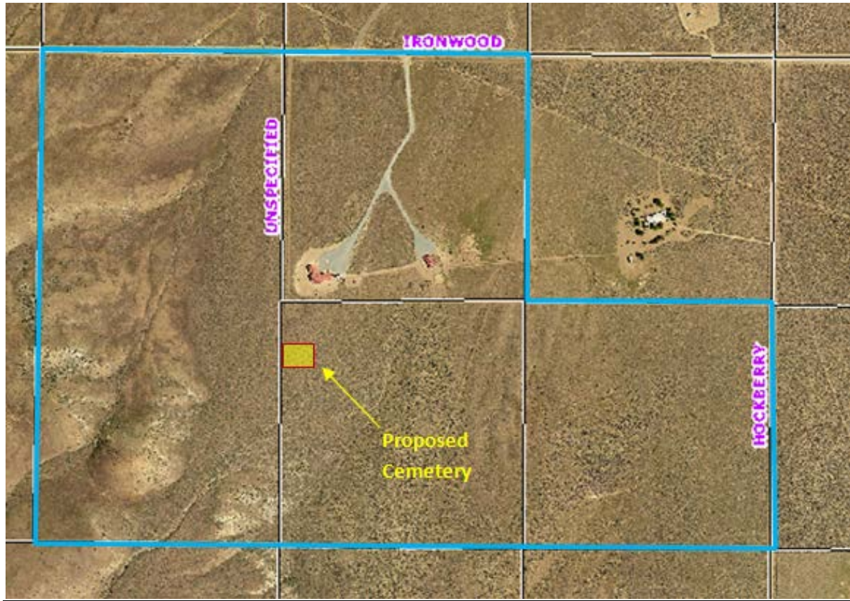
Site Plan #2